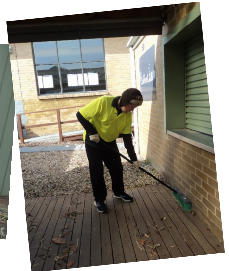
Students participating in Horticulture Elective